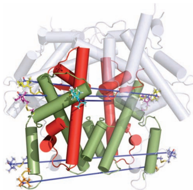
Figure 1. Position of spin labels on the histone octamer. H4, red; H3, green; H2AH2B, grey. Distances measured indicated in blue.

The nucleosome core particle is the basic unit of chromatin structure in eukaryotes and consists of 147bp of double-stranded DNA wrapped twice around a core composed of histones H4, H3, H2A, and H2B, assembled into an octameric arrangement. The nucleosome is essential for compaction of the eukaryotic genome but is also a dynamic assembly that is functional with regards to many processes including those of replication, repair, expression, transcription, and recombination. The structure of the histone core 1,2 and the nucleosome 3 have been determined by X-ray crystallography. X-ray crystallography has been very successful in describing the detailed structure of the nucleosome at high resolution, but although great progress has been achieved through crystallography there are many questions still to be answered and alternative ways of studying the structure and dynamics of the nucleosome and related molecules are desirable.